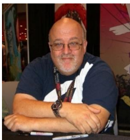
PETER DAVID Marvel Comics