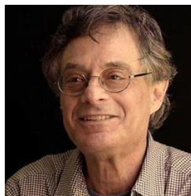
MARC OKRAND Linguist, Klingon language