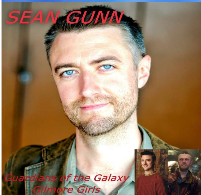
Guardians of the Galaxy Gilmore Girls