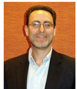
BOB GREENBERGER Author - 100 Greatest Moments of DC Comics